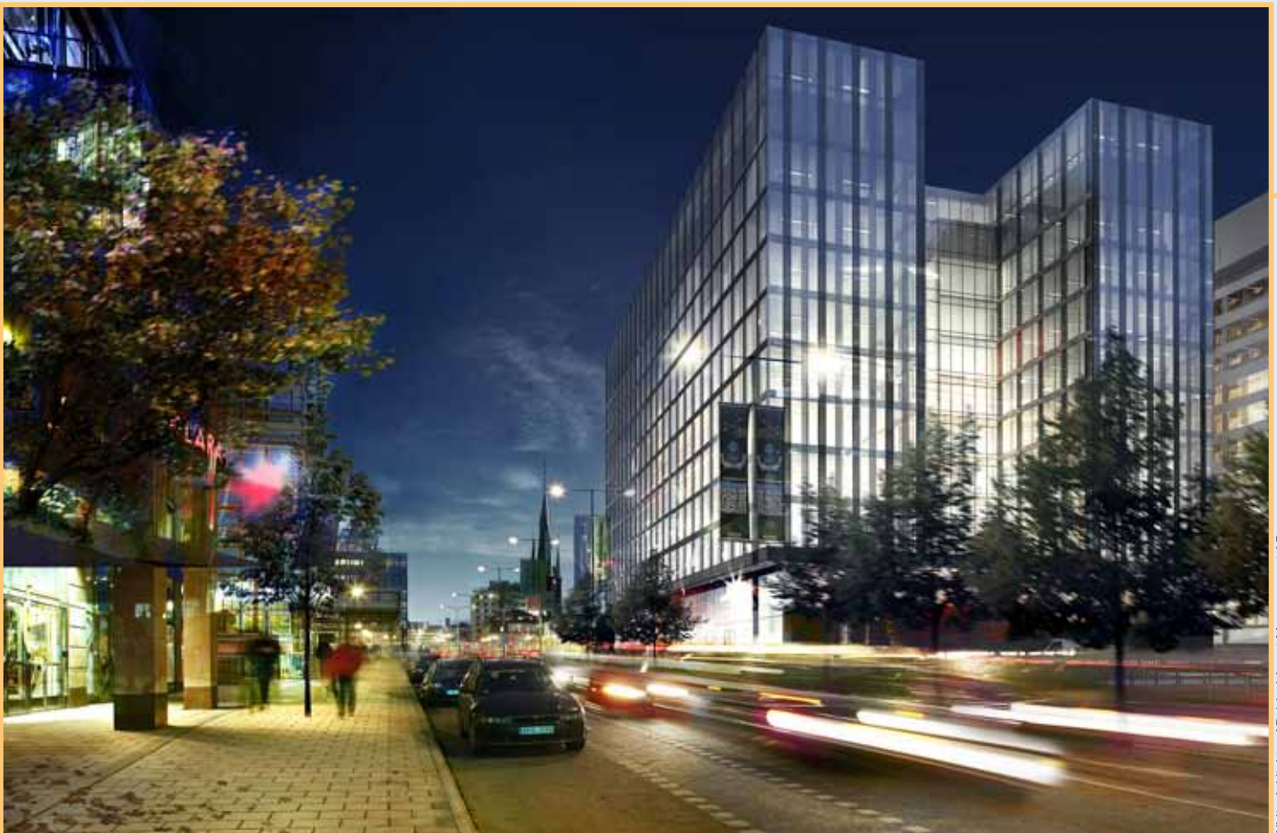
White Arkitekter AB / Jari Asset Management AB